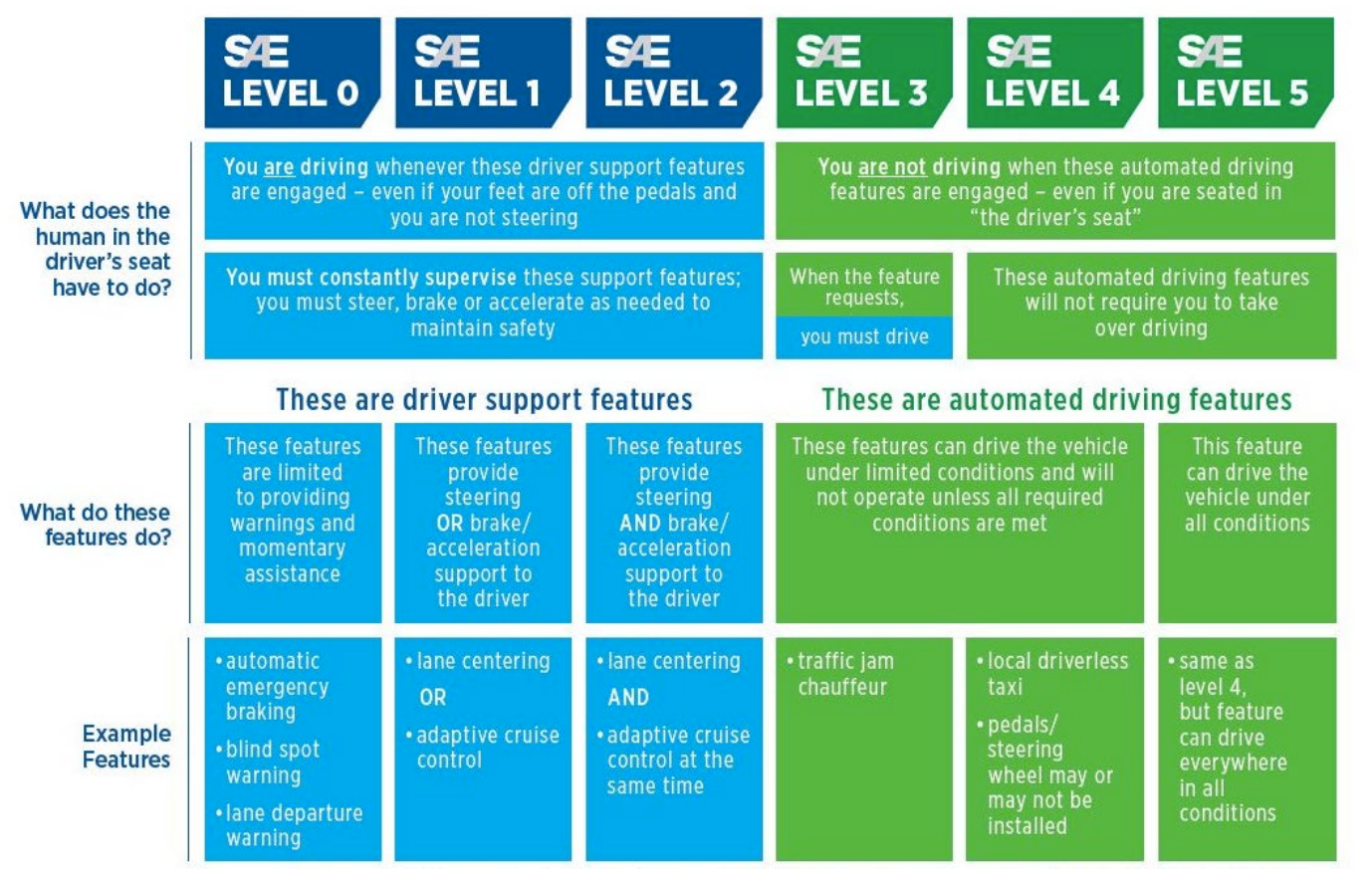
Table 1: Classification System for Vehicle Levels of Automation

These features correspond to a specific "level of automation" on the National Highway Traffic Safety Administration (NHTSA) classification system for AVs.<sup>5</sup> That system, which was adopted based on the Society of Automotive Engineers (SAE) International classifications, defines six different levels of vehicle automation referenced throughout this paper (Table 1).